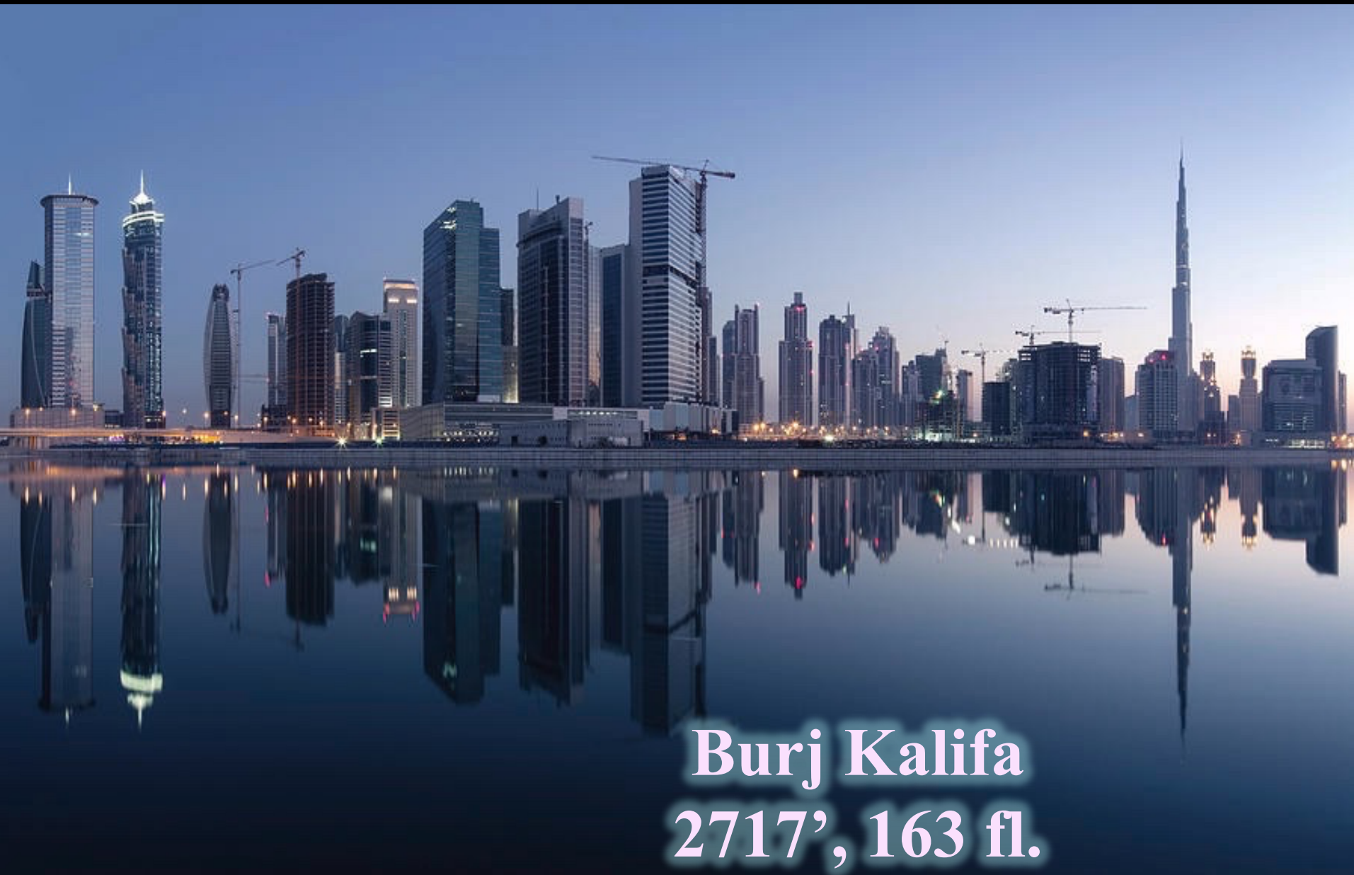
Burj Kalifa 2717', 163 fl.