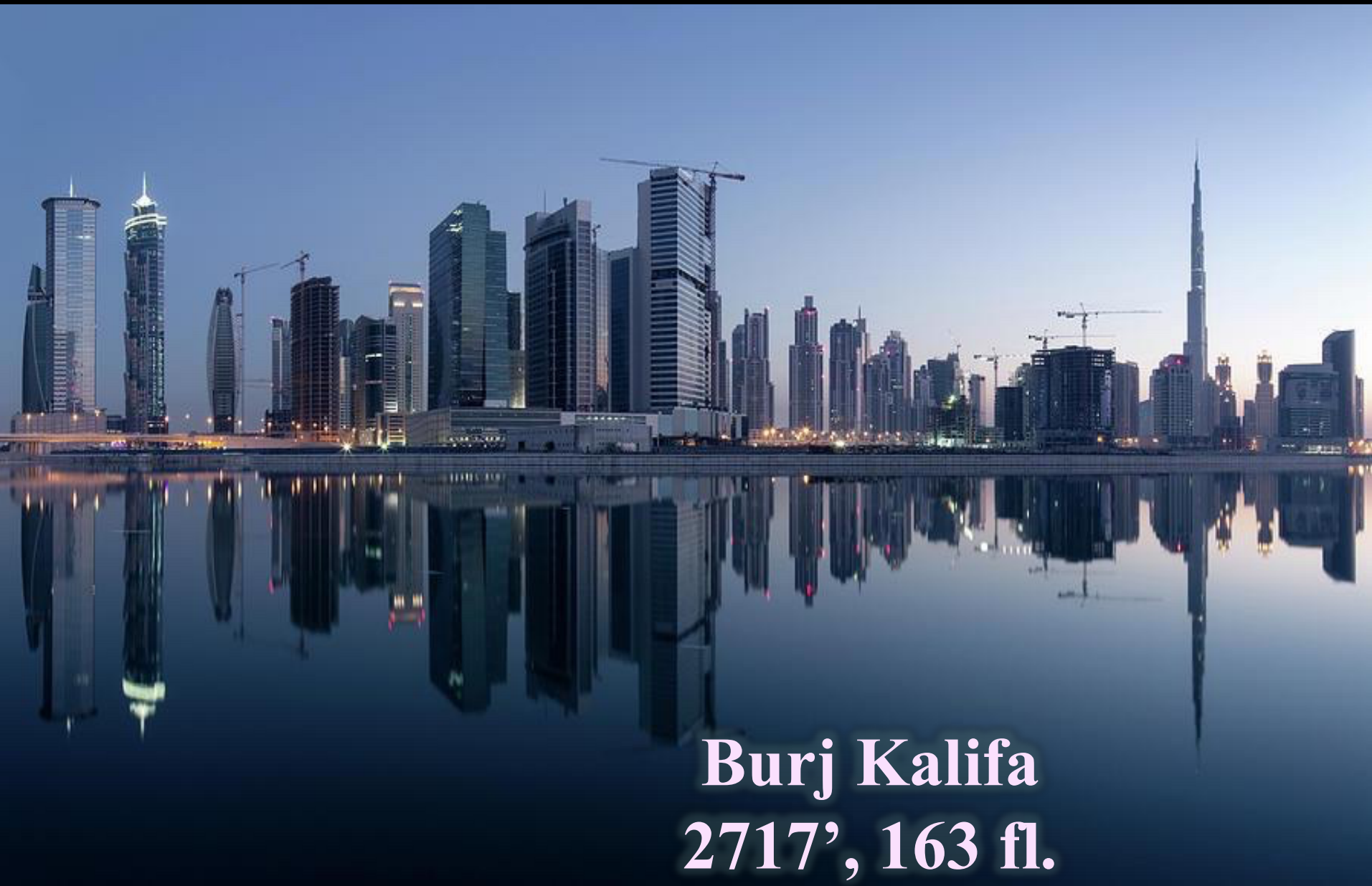
Burj Kalifa 2717', 163 fl.