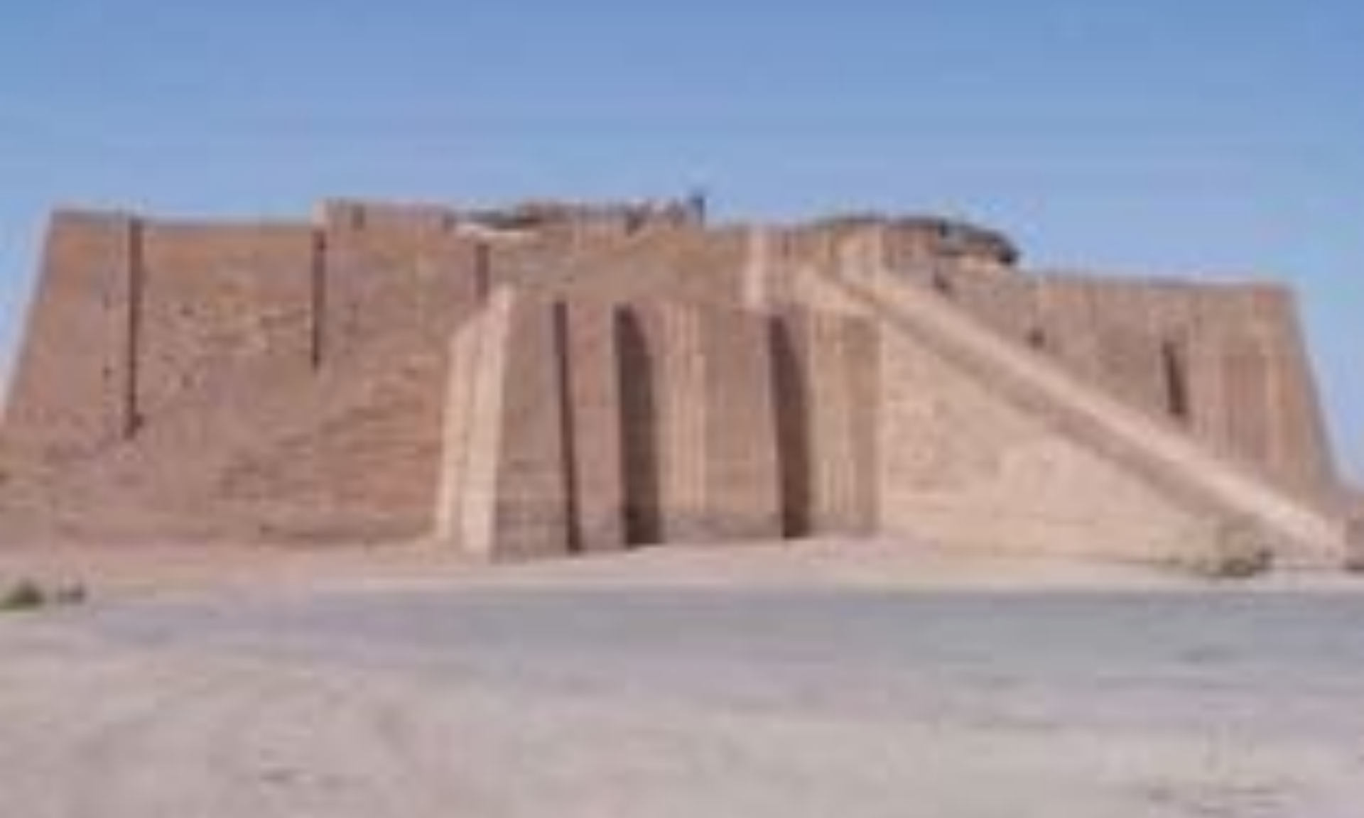
Great Ziggurat - Ur