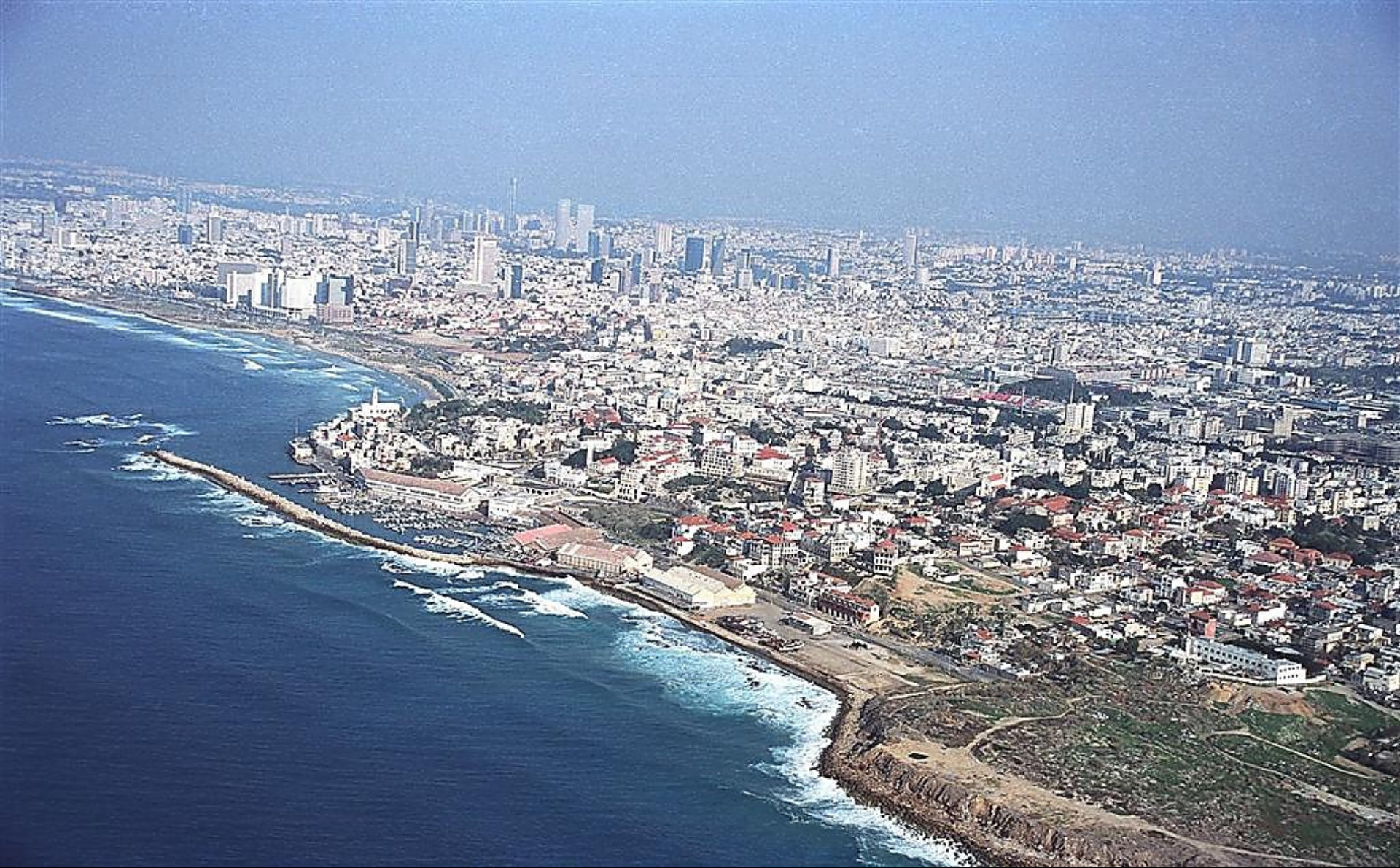
Jaffa and Tel Aviv