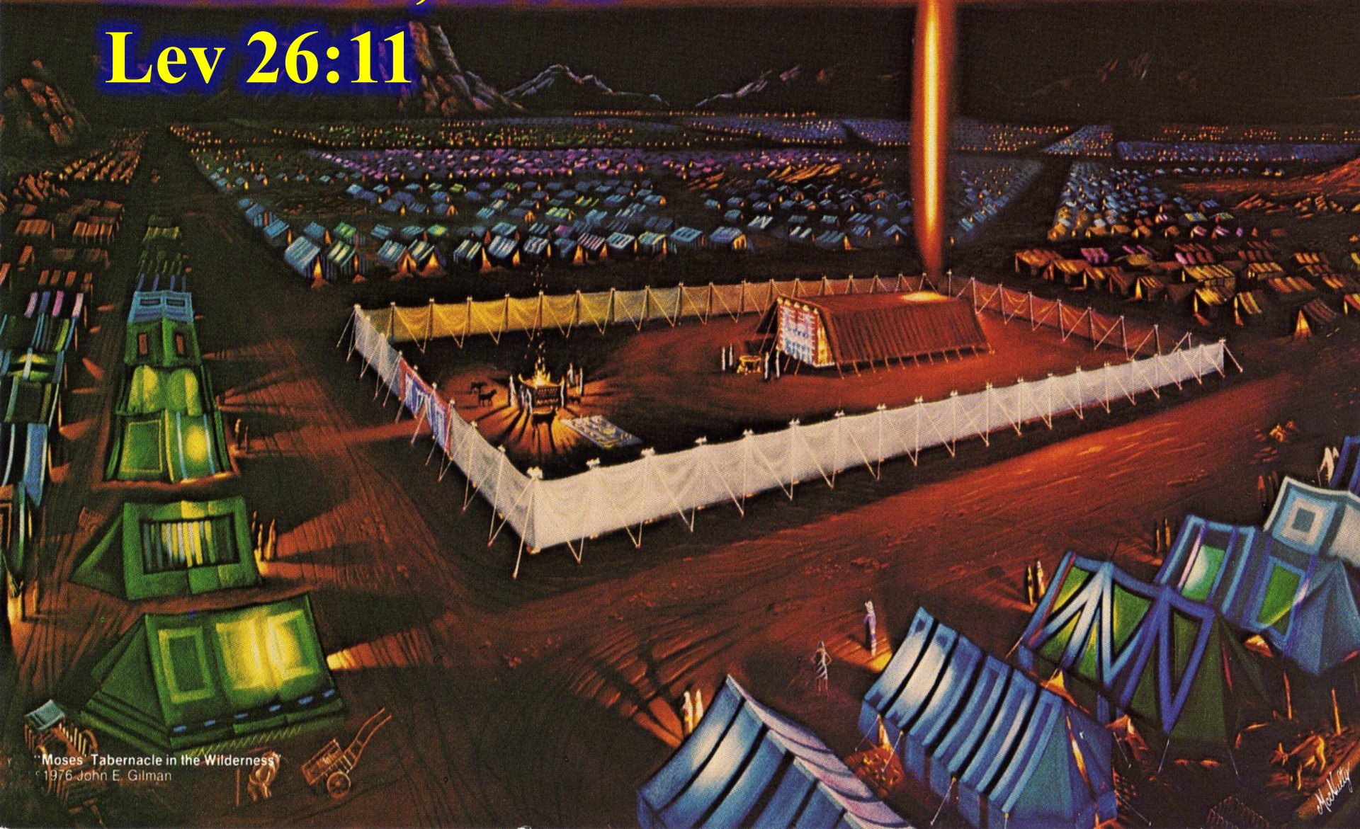
Moses' Tabernacle in the Wilderness