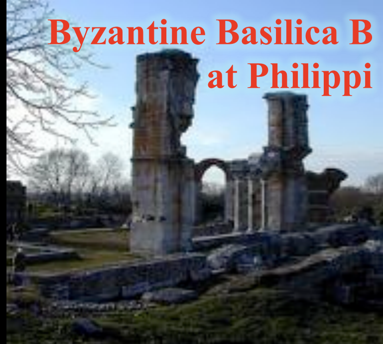
Byzantine Basilica B at Philippi