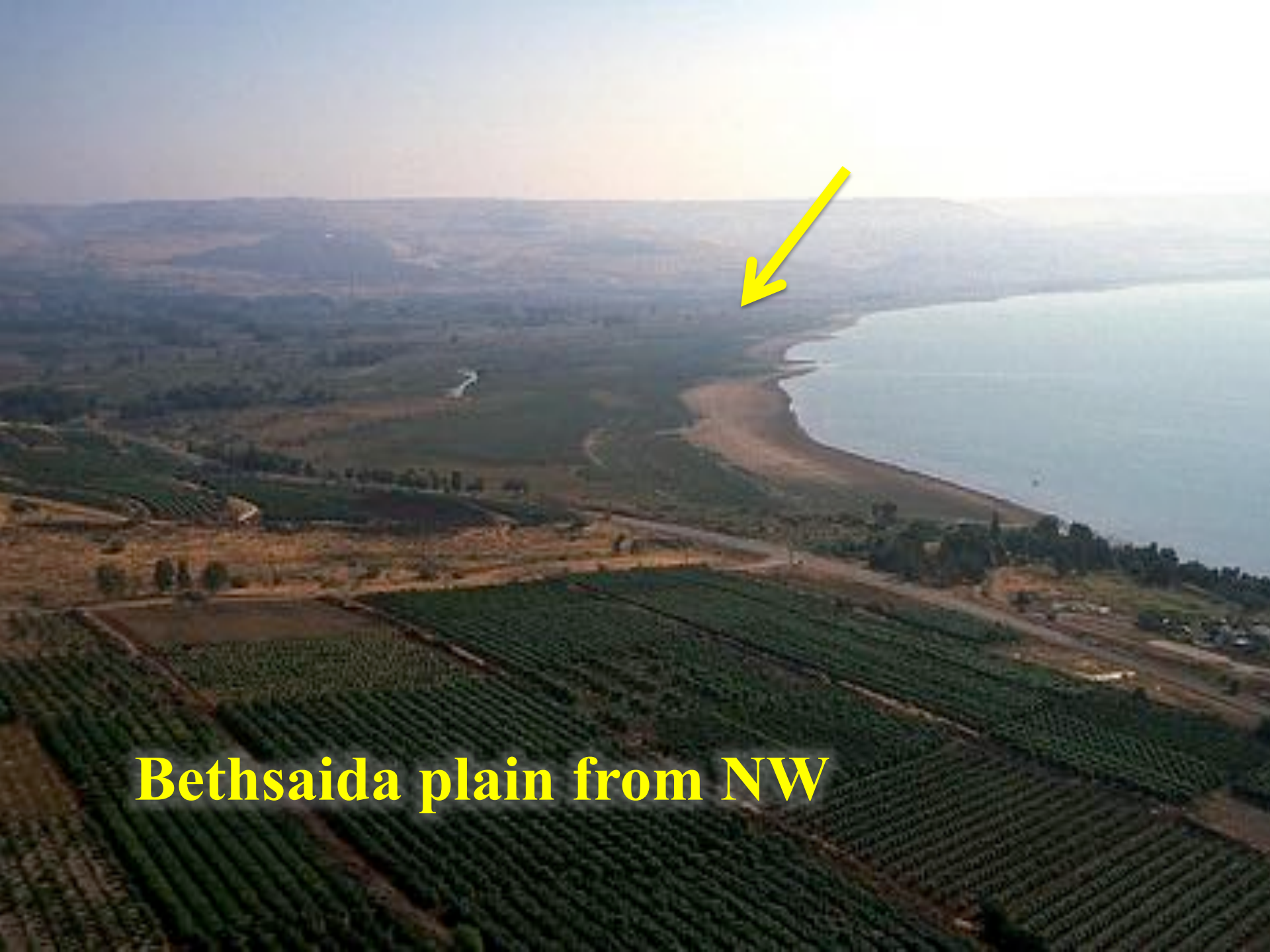
Bethsaida plain from NW