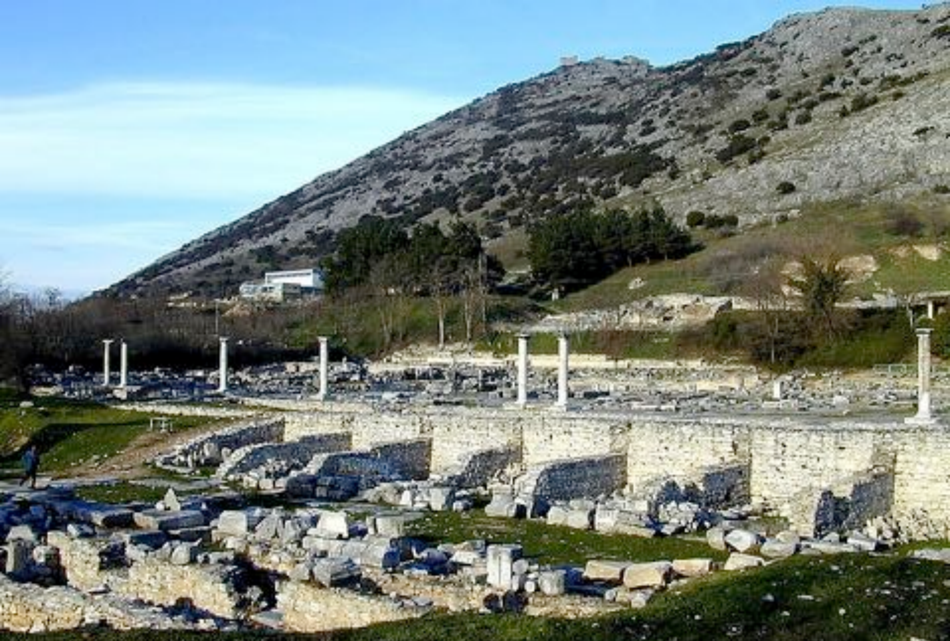
Shops and Forum and Acropolis