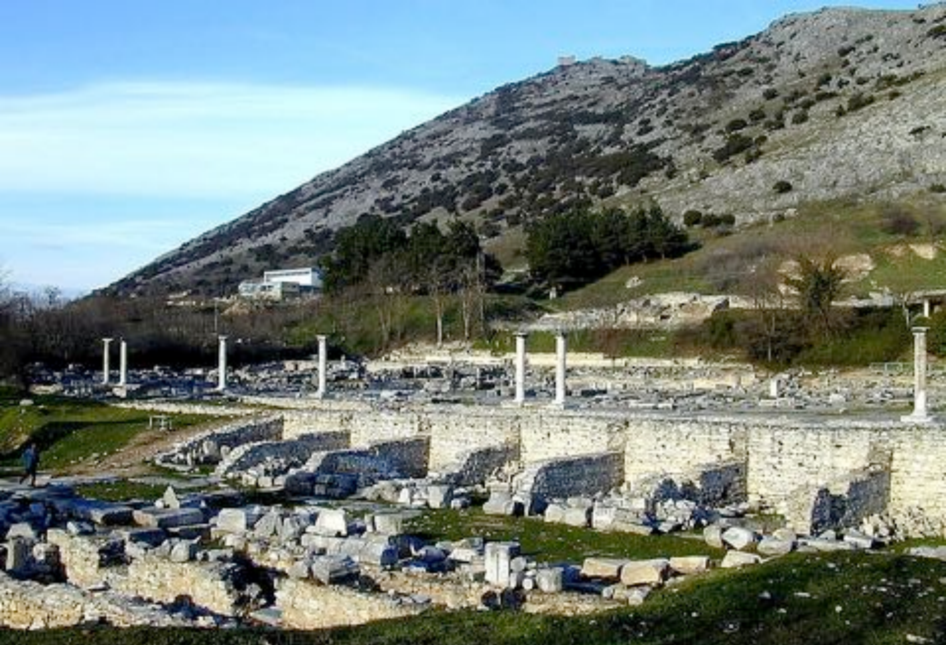
Shops and Forum and Acropolis