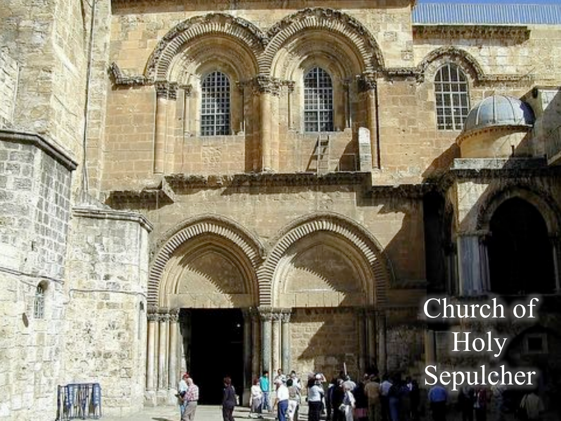
Church of Holy Sepulcher