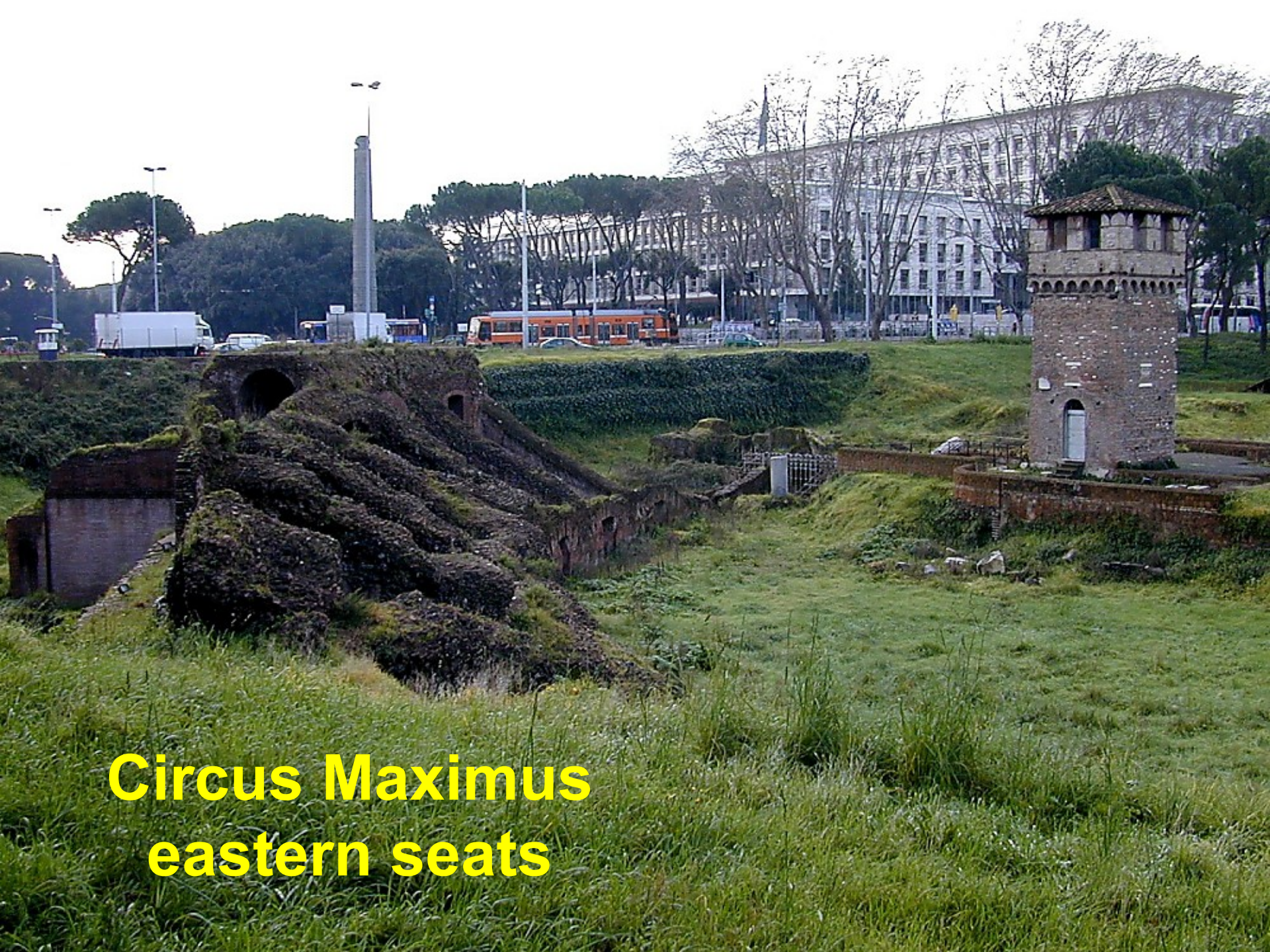
Circus Maximus eastern seats