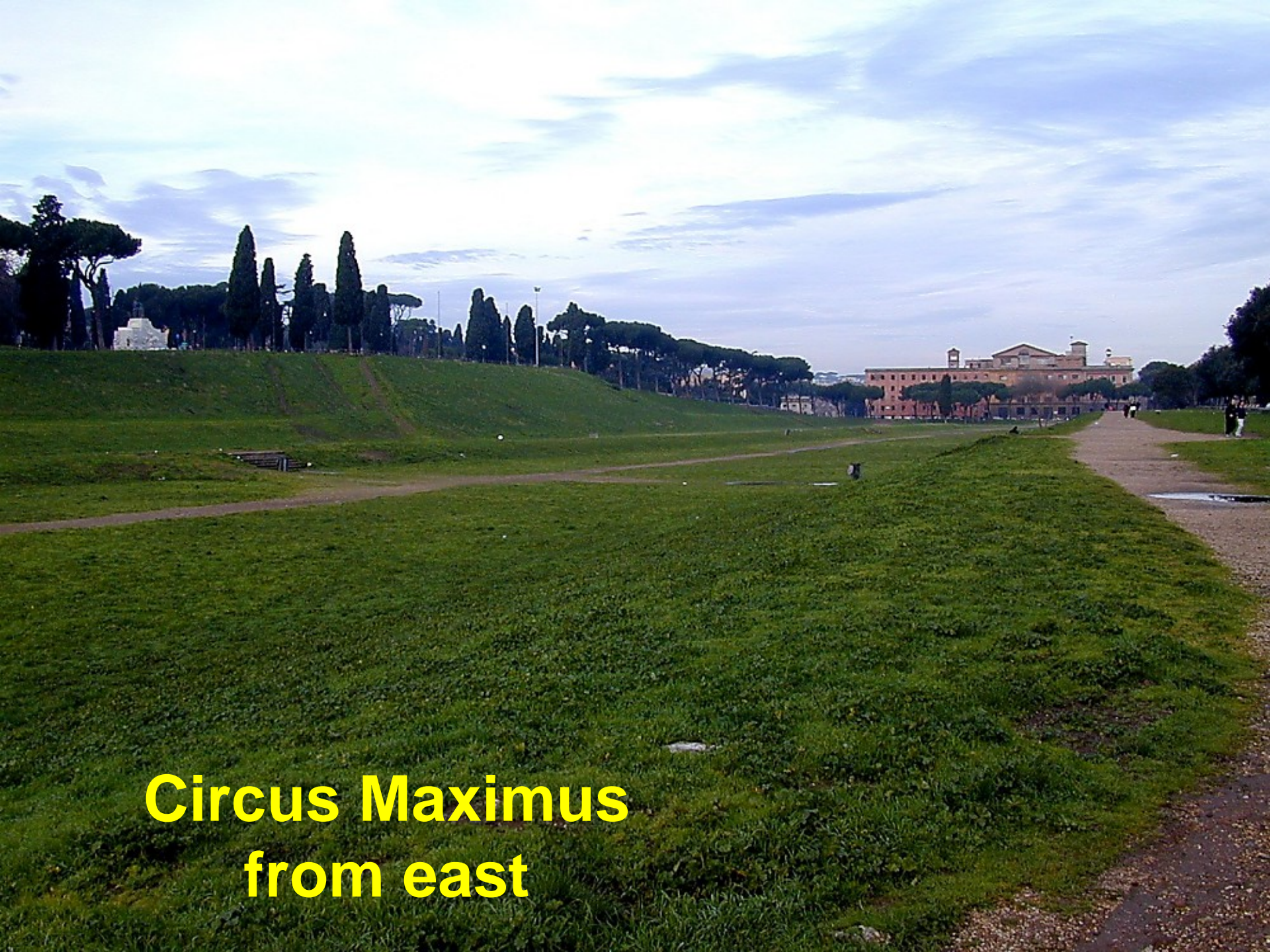
Circus Maximus from east