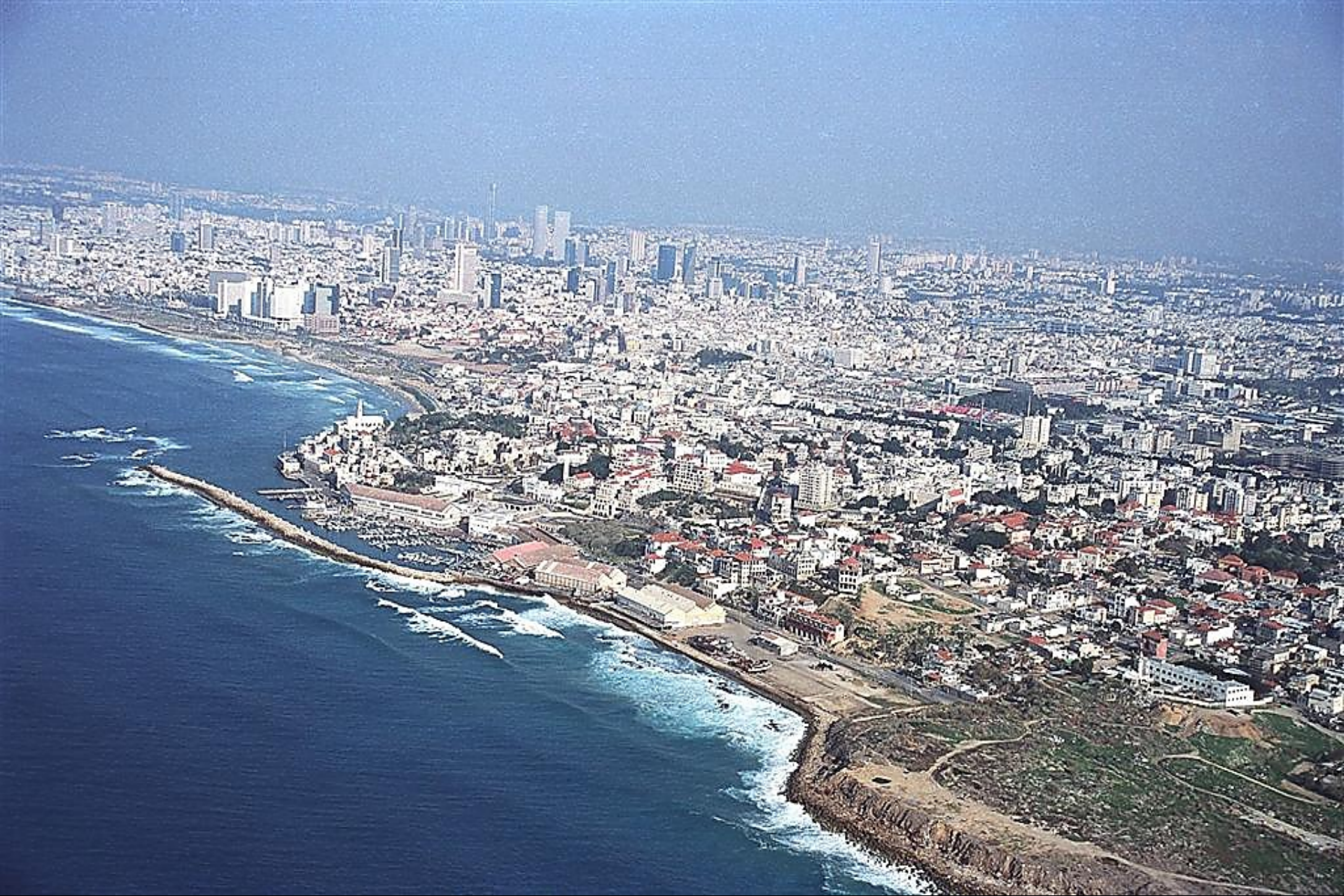
Jaffa and Tel Aviv