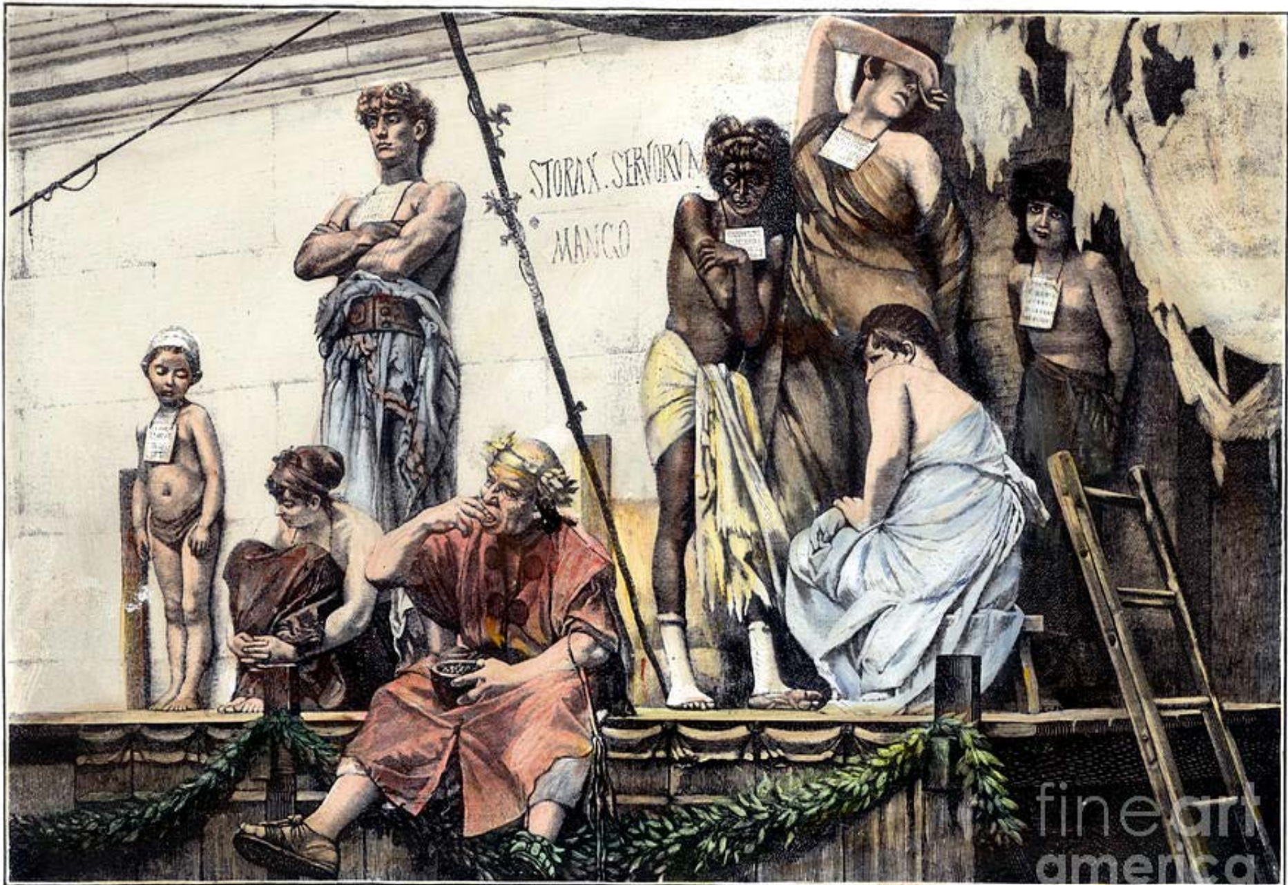
Slave Market in Rome