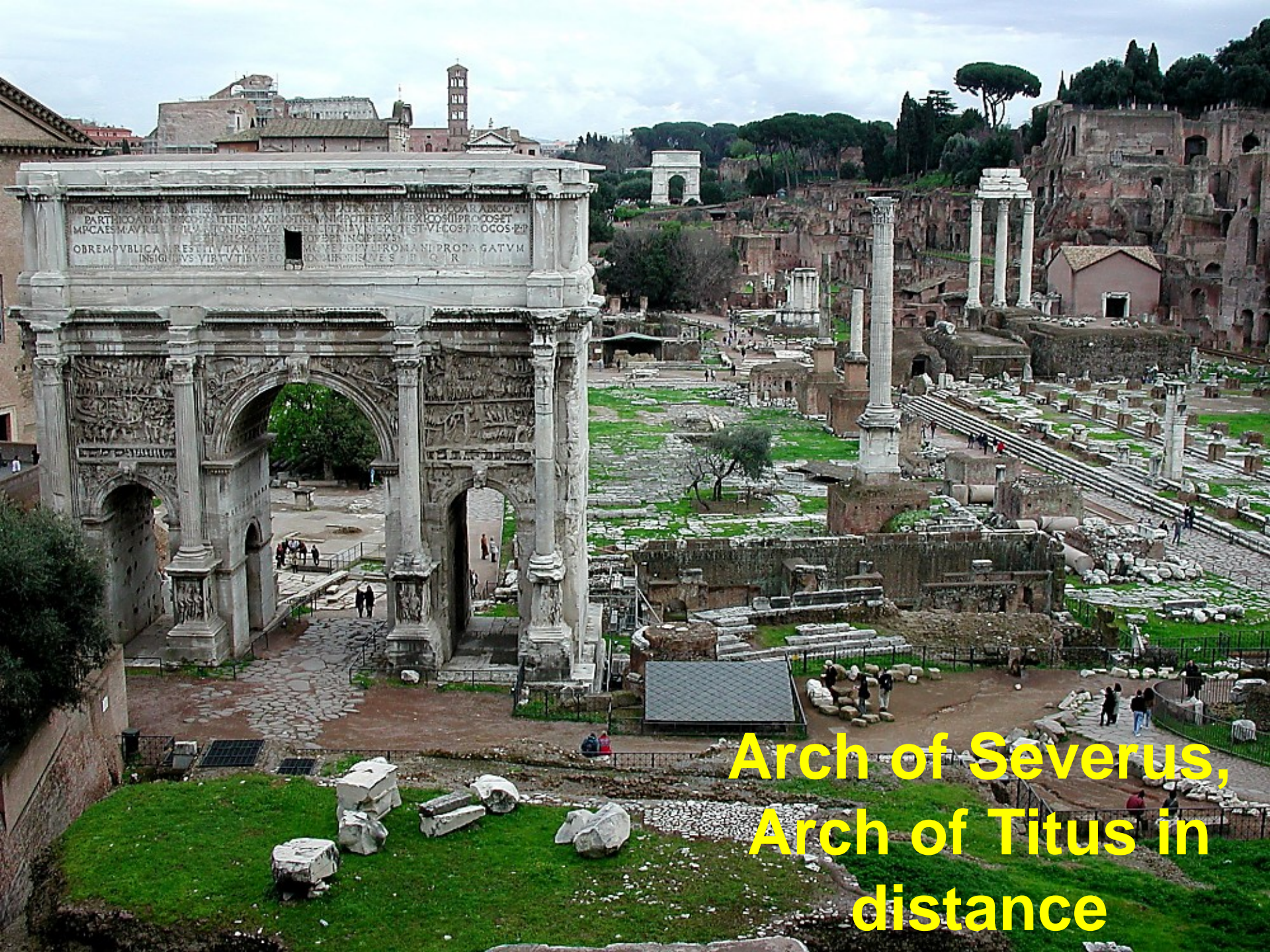
Arch of Severus, Arch of Titus in distance