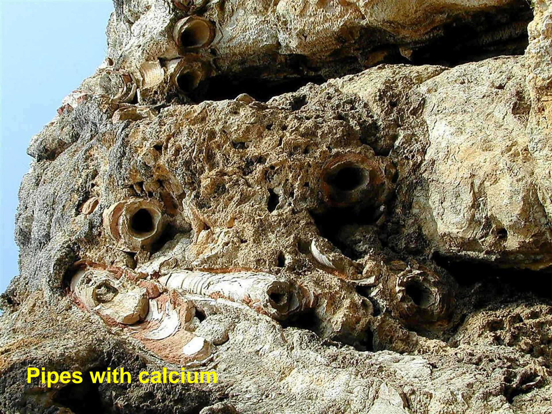
Pipes with calcium