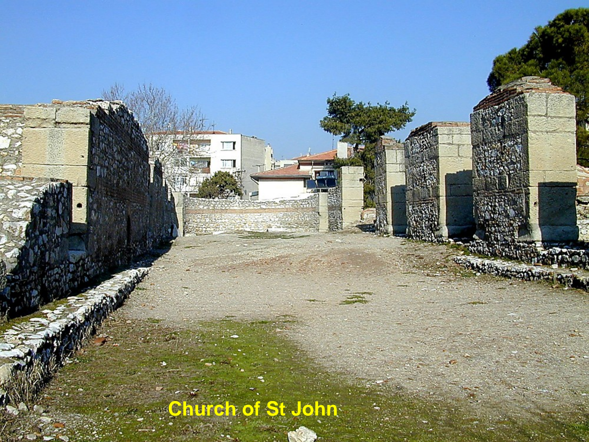
Church of St John