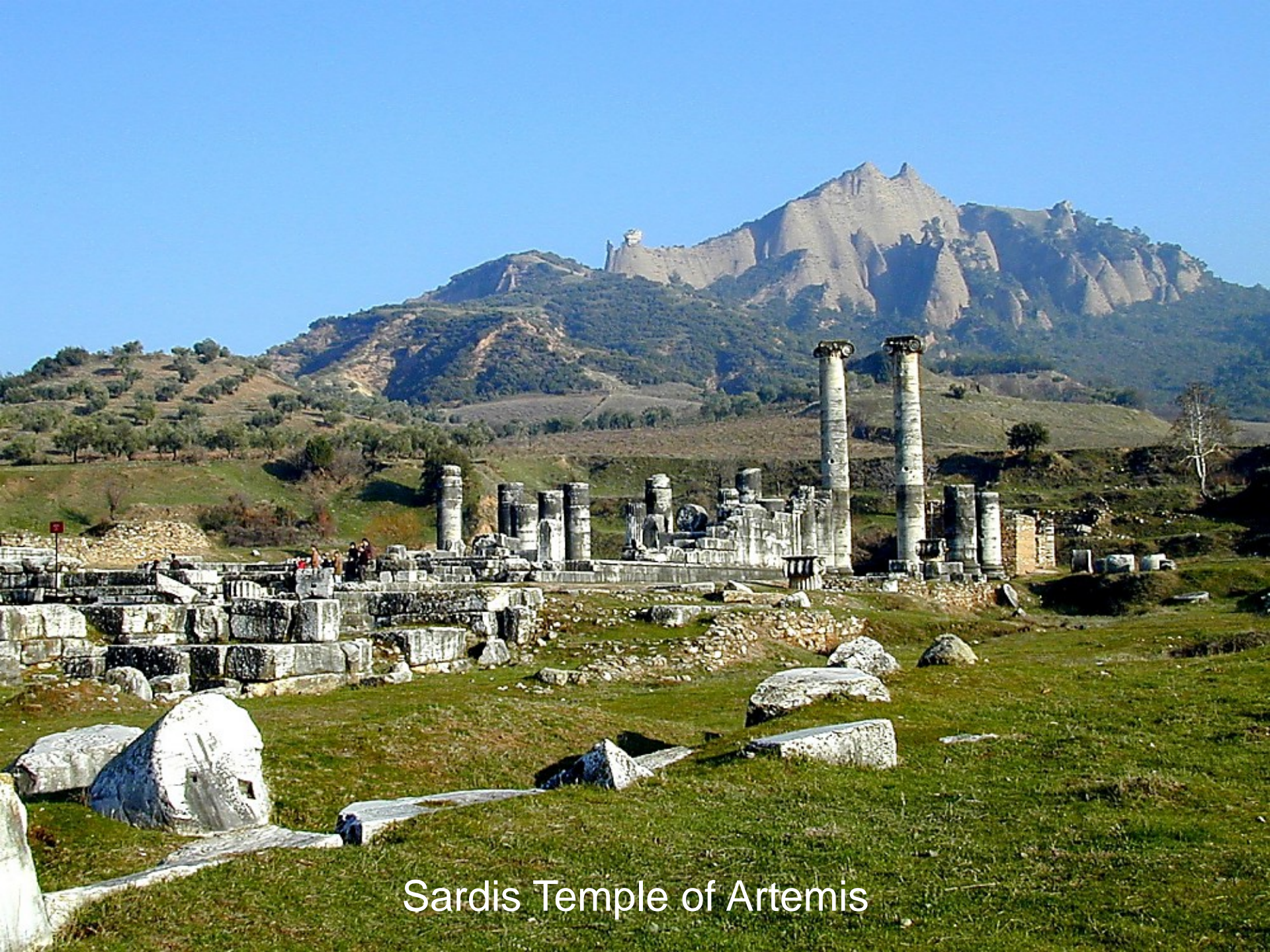
Sardis Temple of Artemis