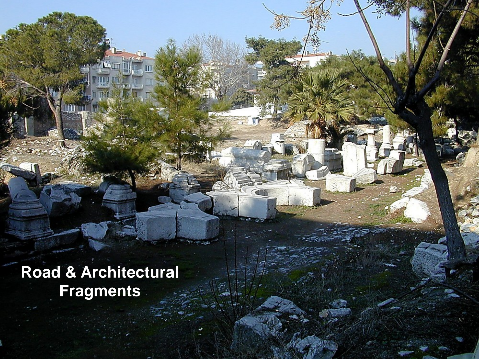
Road & Architectural Fragments