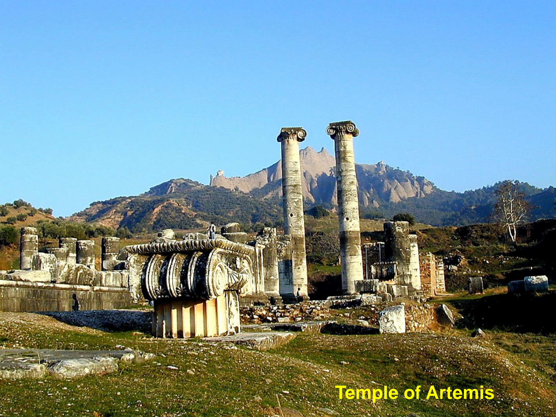
Temple of Artemis