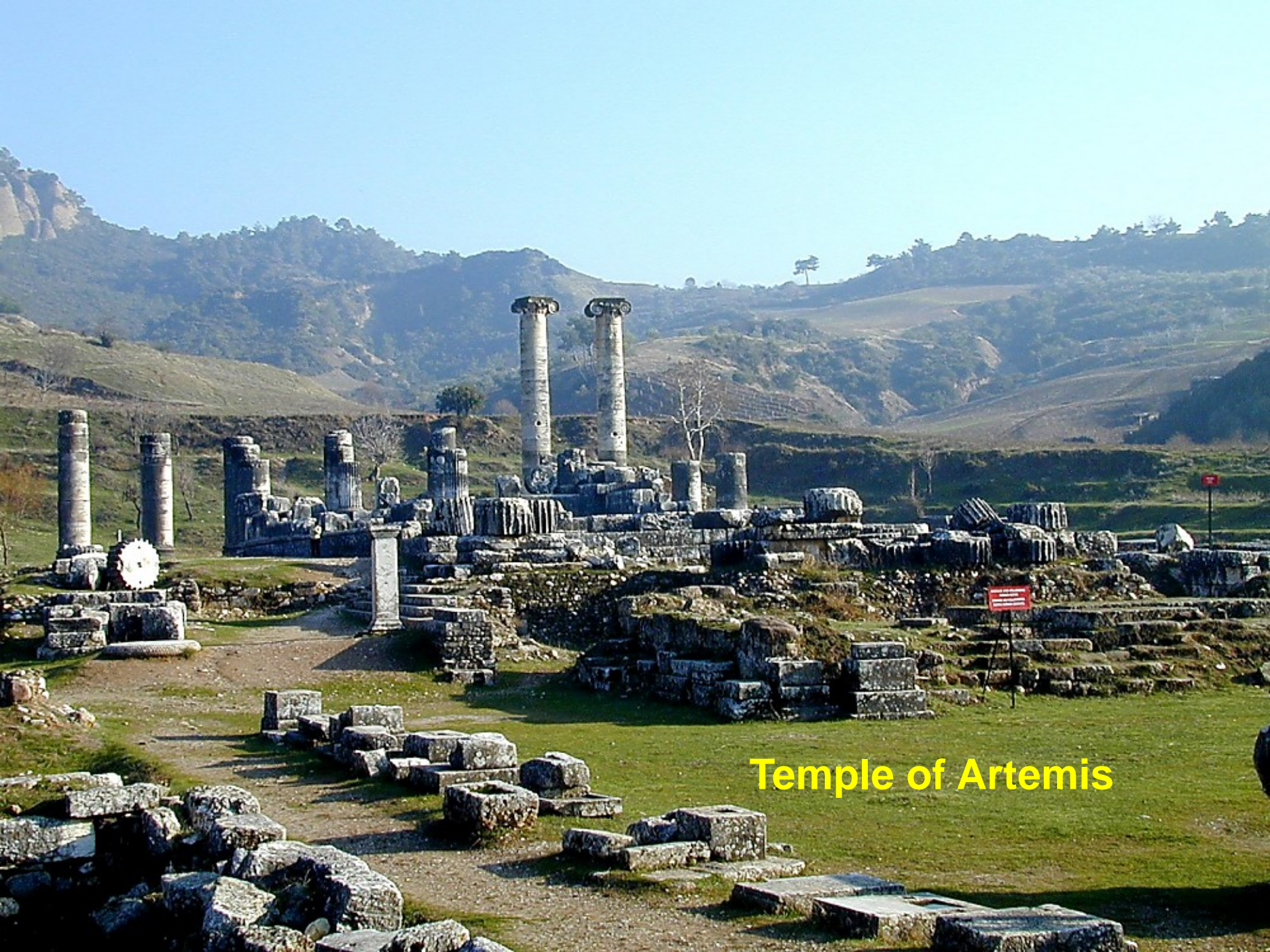
Temple of Artemis