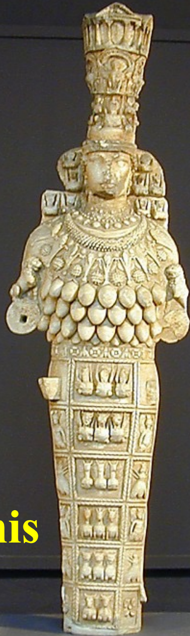
Ephesian Artemis AD 1st c