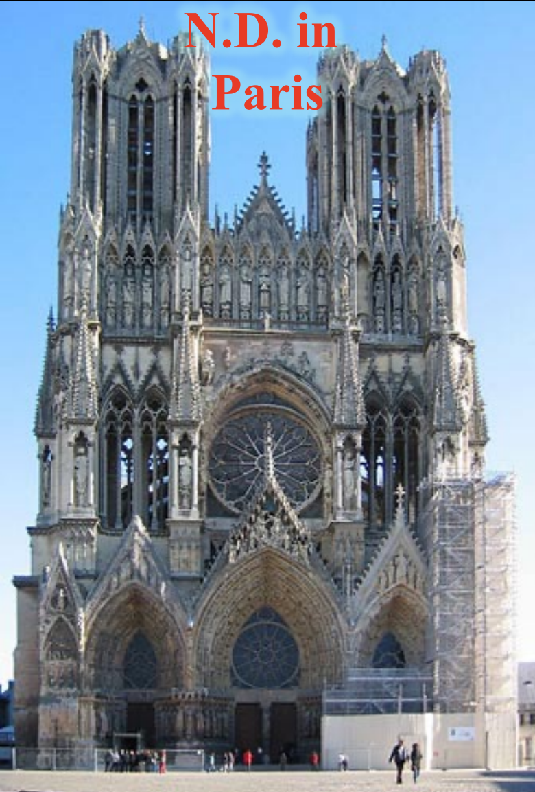
N.D. in Paris